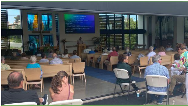
A little Bylaw business... And A LOT OF MAGICAL FUN!