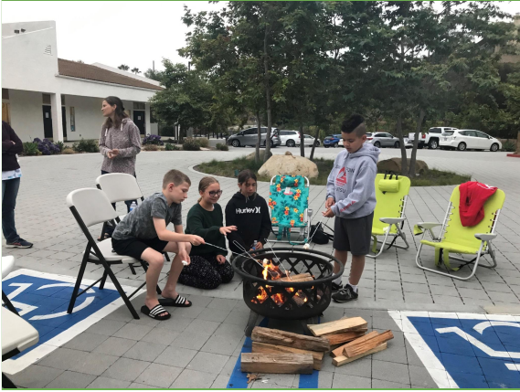
3RD - 5TH GRADERS HAVING S'MORE FUN!