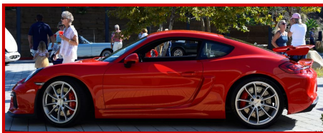
CAR RALLY FUN!

UPCOMING FELLOWSHIP EVENTS: Oktoberfest, October 12, 5pm; Trick or Trunk, October 28, 5:30pm.