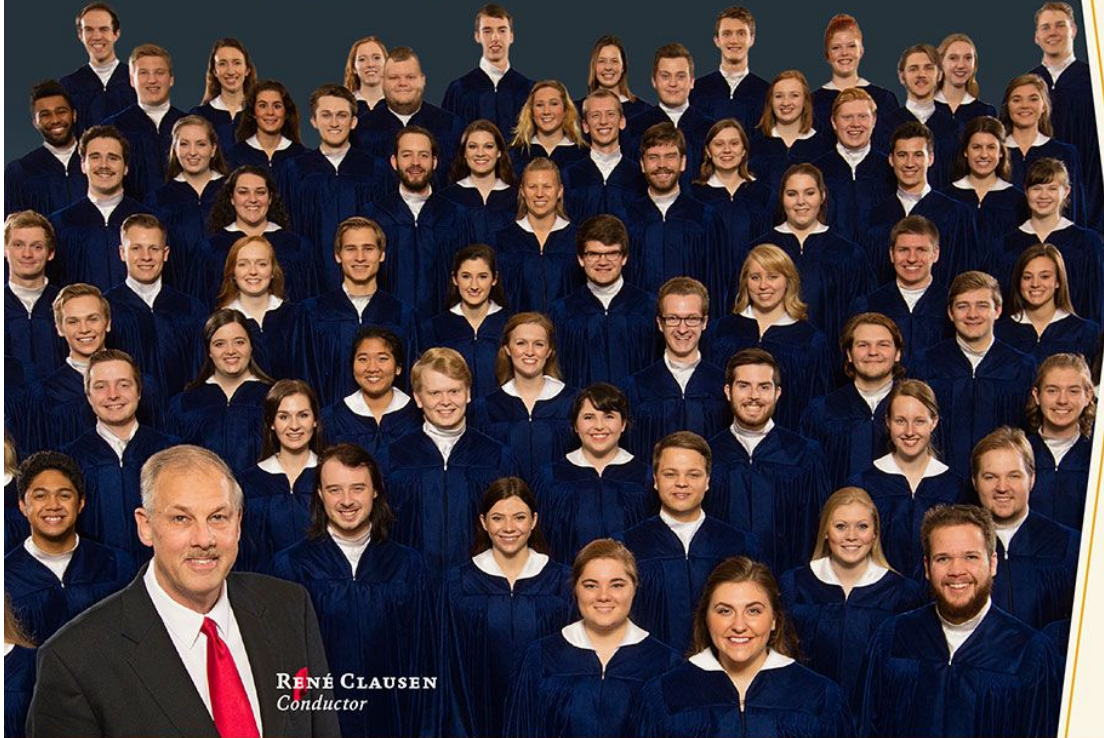
RENÉ CLAUSEN Conductor